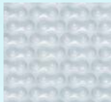
Clear 500 Micron

Sunlover Heating pool blankets are designed to deliver long life in an environment dominated by UV laden solar rays, chemicals and salt.