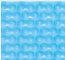
Reef Blue 400, 500 Micron